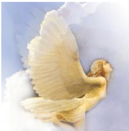
spread your wings

Telephone readings can be extremely accurate and helpful for clients who prefer to have their readings in the comfort of home. These angel readings are enlightening, insightful and uplifting. Your angels and guides want to guide you towards a happier more joyful and fulfilling life and their Divine guidance can make it possible. They are near you constantly and this is a unique opportunity for them to be heard. Be open to a very special and meaningful experience.